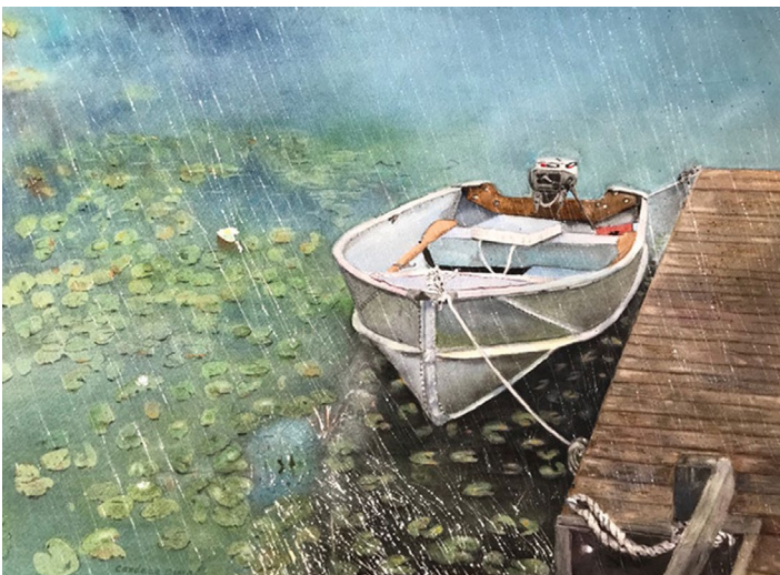
LEFT: " Done Fishing " by Candace Cima