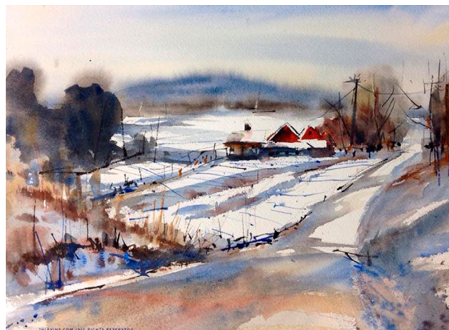
TOP TO BOTTOM: