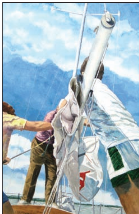
TOP LEFT: "America".