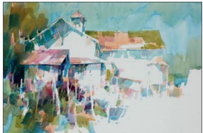
Top: Gazebo by Fred Graff. Bottom: Back of Shrocks by Fred Graff.