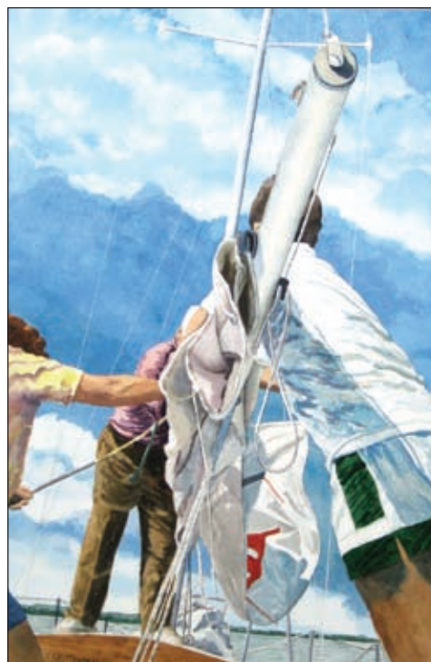
TOP LEFT: "America". BOTTOM LEFT TO RIGHT: "Zachary" and "Furling the Main".